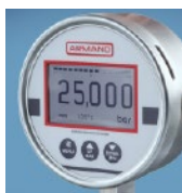
Electronic Pressure Measurement