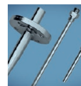
Thermowells & Accessories