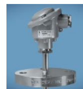
Electrical Temperature Measurement