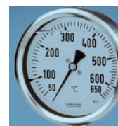
Mechanical Temperature Measurement