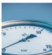
Mechanical Pressure Measurement